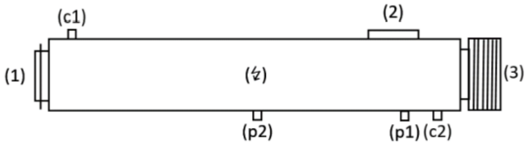
Fig. 4.3.2.3.1-2 2 Configuration with ERD (3) mounted at the front end of the test vessel