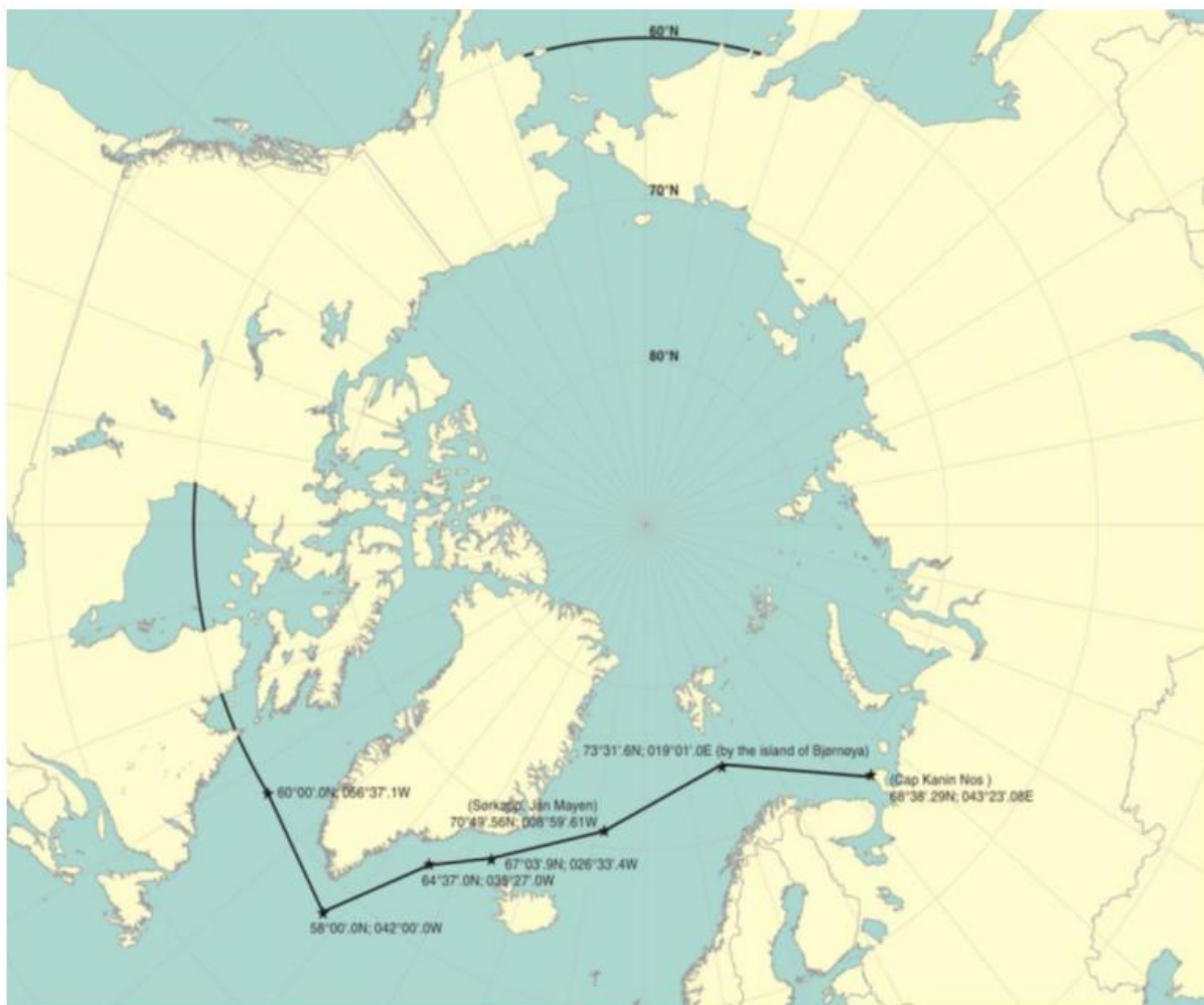
Fig. 1.1.1-1 Maximum extent of Arctic waters application 1

.1 Arctic waters are those waters which are located north of a line from the latitude 58°00',0 N and longitude 042°00',0 W to latitude 64°37',0 N, longitude 035°27',0 W and thence by a rhumb line to latitude 67°03',9 N, longitude 026°33',4 W and thence by a rhumb line to the latitude 70°49',56 N and longitude 008°59',61 W (Sørkapp, Jan Mayen) and by the southern shore of Jan Mayen to 73°31',6 N and 019°01',0 E by the Island of Bjørnøya, and thence by a great circle line to the latitude 68°38',29 N and longitude 043°23',08 E (Cap Kanin Nos) and hence by the northern shore of the Asian Continent eastward to the Bering Strait and thence from the Bering Strait westward to latitude 60° N as far as Il'pyrskiy and following the 60th North parallel eastward as far as and including Etolin Strait and thence by the northern shore of the North American continent as far south as latitude 60° N and thence eastward along parallel of 0° N, to longitude 056°37',1 W and thence to the latitude 58°00',0 N, longitude 042°00',0 W (refer to Fig. 1.1.1-1 );