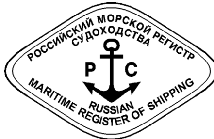
Fig. 2.6 Imprint specimen of the RS surveyor's stamp

2.6 The RS surveyor's stamp imprint is shown in Fig. 2.6 .